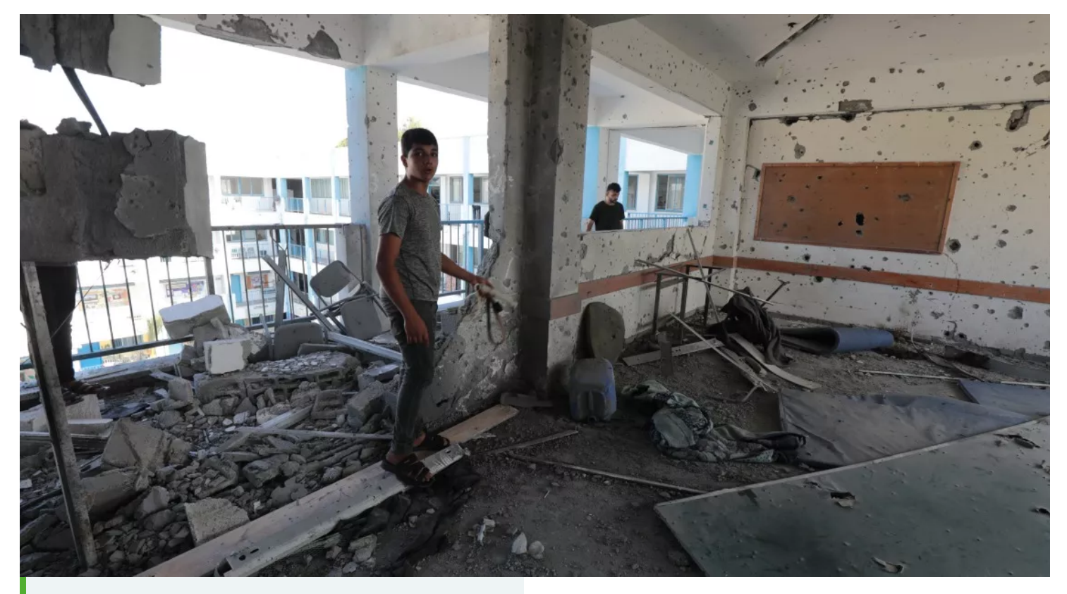
Two children walk in a destroyed classroom in Gaza.

Hunger is so extreme that nearly every household does not have enough food to meet their daily needs. In fact, a staggering 80% of the global population facing famine or catastrophic levels of hunger are located in Gaza.