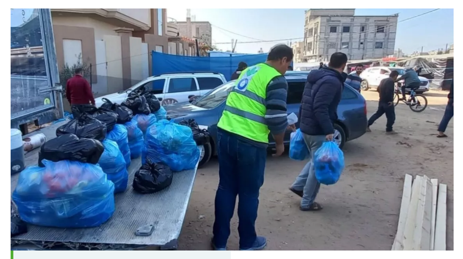
Action Against Hunger teams distribute food in Gaza.

From October 18 to December 21, our teams reached 340,000 people in Gaza, nearly half of them children. Half of the families we supported were in Rafah, and the rest were in Khan Younis (18%), northern Gaza (18%), and central Gaza (14%).