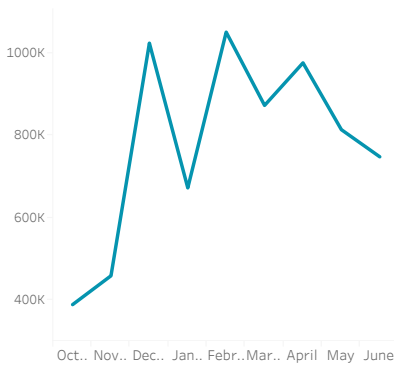
People reached per month (October 2023-June 2024)

The boundaries and names shown and the designations used in this map do not imply official endorsement or acceptance by the United Nations.