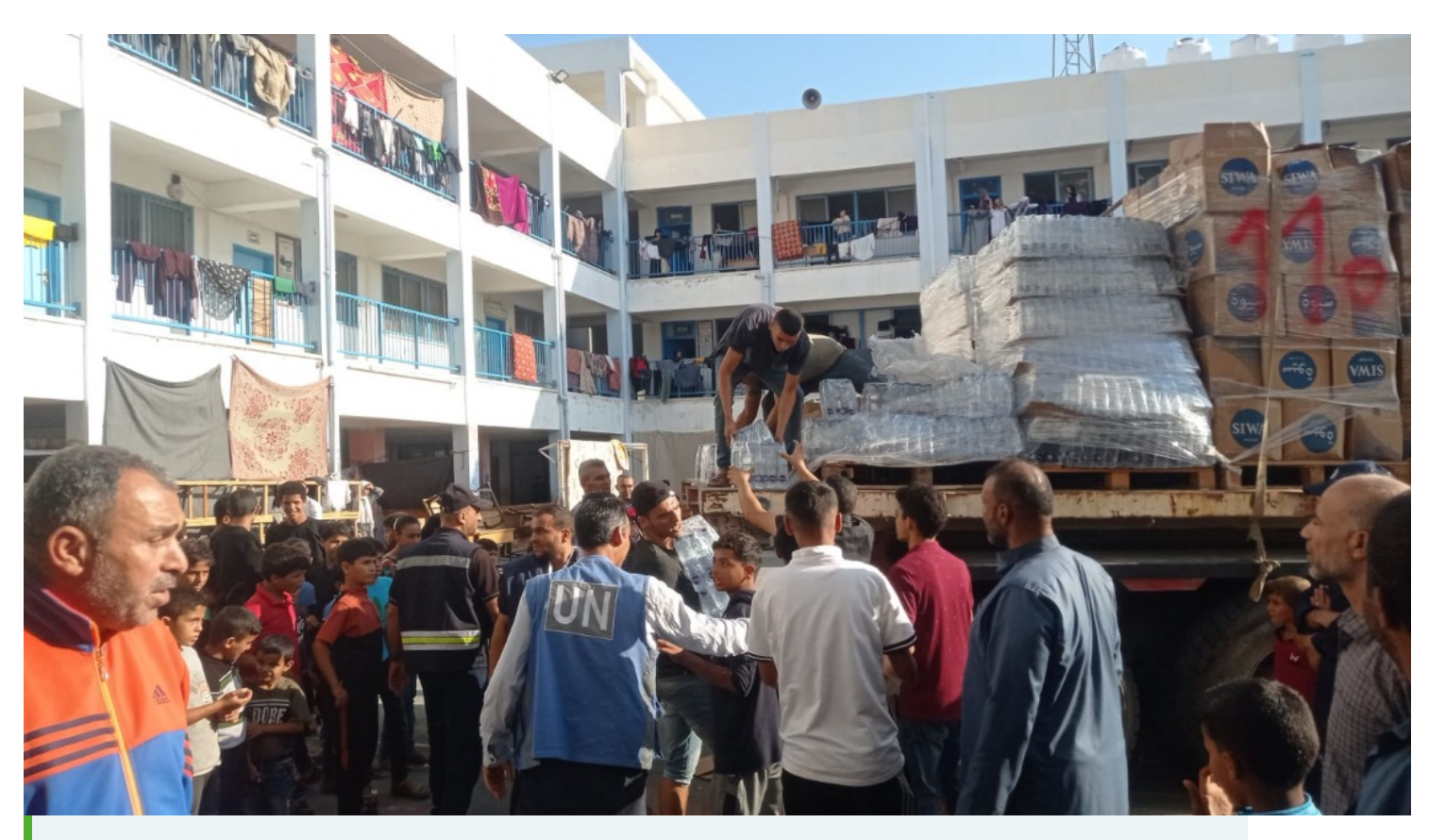
Action Against Hunger is distributing much-needed supplies, including clean water, to people in Gaza.

Our emergency team is assessing immediate needs and coordinating with international and local partners to distribute lifesaving supplies from Egypt. We continue to work with suppliers who have stocks inside Gaza to distribute basic supplies such as water, food, hygiene products, diapers, blankets, and mattresses as efficiently and quickly as possible at short notice.