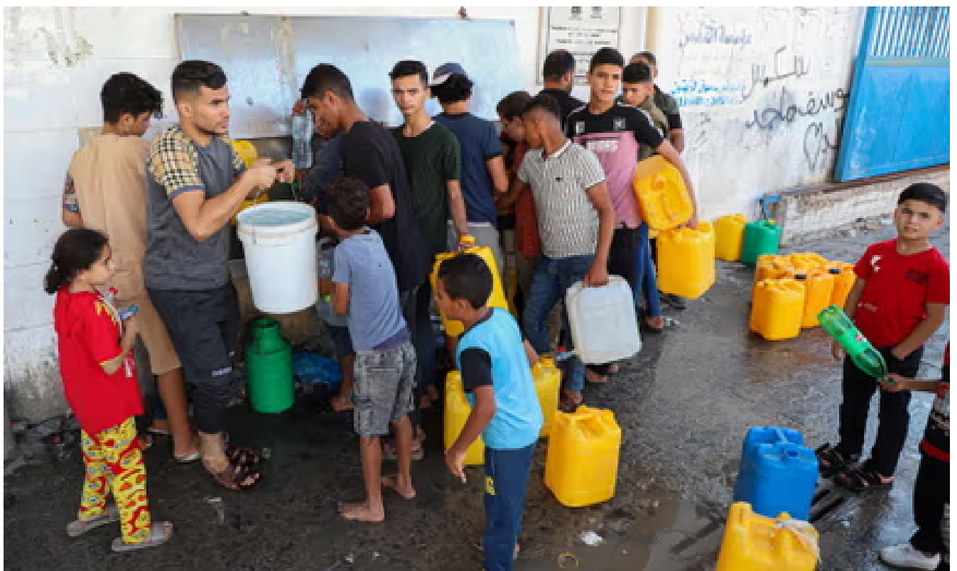
📷 Palestinians fetch water in the southern Gaza Strip city of Khan Younis.

Staff at the charity say overcrowded displacement shelters are close to breaking point. They add that one shelter in Gaza is currently supporting more than 24,000 people and that 60% of the children there are affected by diarrhoea. Some people are also resorting to open defecation.